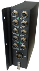
Locomotive Ethernet Switch (ESW)