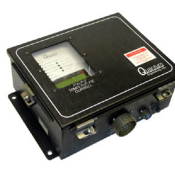
Cooling Fan Controllers