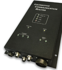
Locomotive Communication Router (LCR)