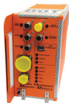
Crash Hardened Memory Module (CHMM)