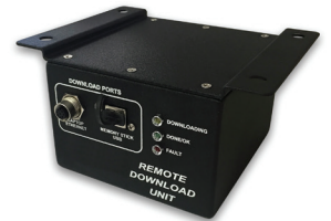
Remote Download Unit (RDU)