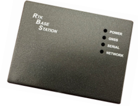
Real-Time Kinematic (RTK) Base Station