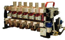
BKT & Reversers