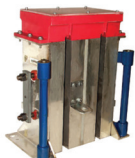
IGBT Rectifier Panels