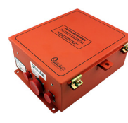
Digital Event Recorders