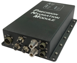
Precision Navigation Module (PNM)