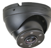
Analog or IP Cameras