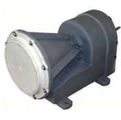
Radar Speed Sensor