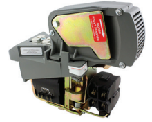
Magnetic Power Contactors