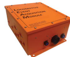
LEAM - Event Recorder