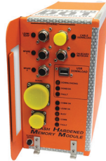
Crash Hardened Memory Module (CHMM)