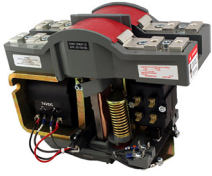
Magnetic Transfer Switches