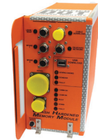
Crash Hardened Memory Module (CHMM)