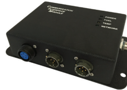
Communications Interface Module (CIM)