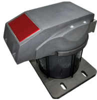
Diesel Fuel Pumps