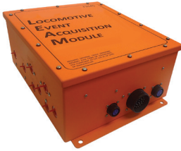
Locomotive Event Acquisition Module (LEAM)