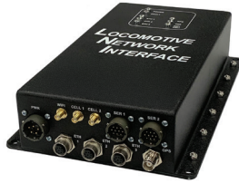
Locomotive Network Interface (LNI)