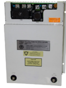
Power Supply Panels