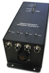
Redundant Speed Supply (RSS)