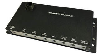
Air Brake Manifold (ABM)